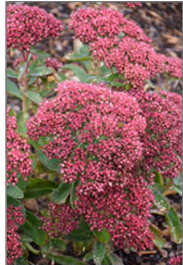
Munstead Dark Red Stonecrop flowers

This is a relatively low maintenance plant, and is best cleaned up in early spring before it resumes active growth for the season. It is a good choice for attracting bees and butterflies to your yard, but is not particularly attractive to deer who tend to leave it alone in favor of tastier treats. It has no significant negative characteristics.