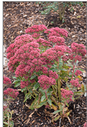
Munstead Dark Red Stonecrop in bloom