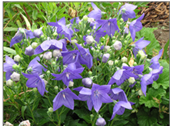
Sentimental Blue Balloon Flower in bloom

We are so proud of the nursery stock that we have carefully selected for superior quality and performance, WE GUARANTEE ALL TREES, SHRUBS, EVERGREENS FOR 2 YEARS, AND ROSES FOR 1 YEAR!