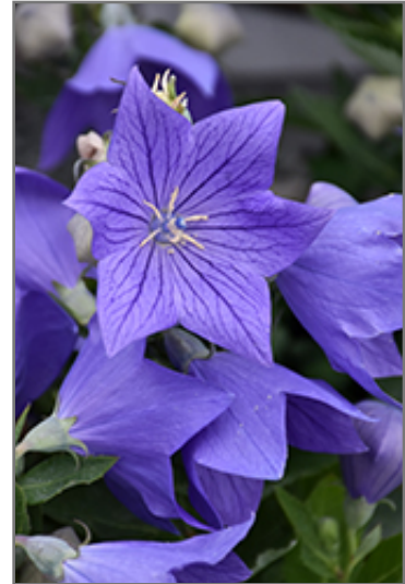
Sentimental Blue Balloon Flower flowers

This is a relatively low maintenance plant, and is best cleaned up in early spring before it resumes active growth for the season. It has no significant negative characteristics.