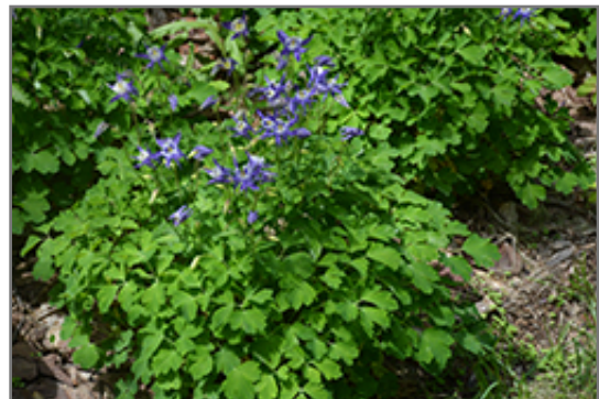
Winky Blue And White Columbine in bloom

We are so proud of the nursery stock that we have carefully selected for superior quality and performance, WE GUARANTEE ALL TREES, SHRUBS, EVERGREENS FOR 2 YEARS, AND ROSES FOR 1 YEAR!