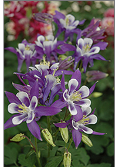
Winky Blue And White Columbine flowers

Winky Blue And White Columbine is an herbaceous perennial with an upright spreading habit of growth. Its relatively fine texture sets it apart from other garden plants with less refined foliage.