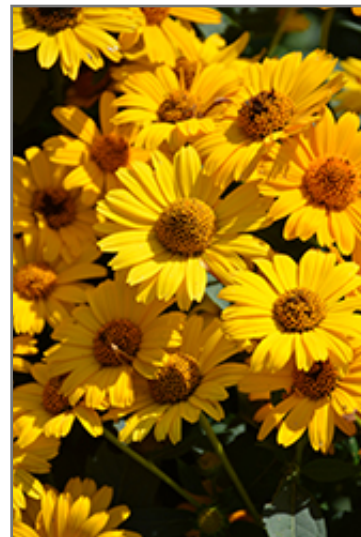
Tuscan Sun False Sunflower flowers

Tuscan Sun False Sunflower is an herbaceous perennial with an upright spreading habit of growth. Its medium texture blends into the garden, but can always be balanced by a couple of finer or coarser plants for an effective composition.