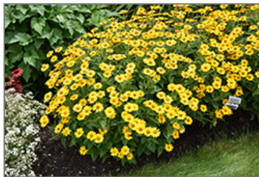
Tuscan Sun False Sunflower in bloom

We are so proud of the nursery stock that we have carefully selected for superior quality and performance, WE GUARANTEE ALL TREES, SHRUBS, EVERGREENS FOR 2 YEARS, AND ROSES FOR 1 YEAR!