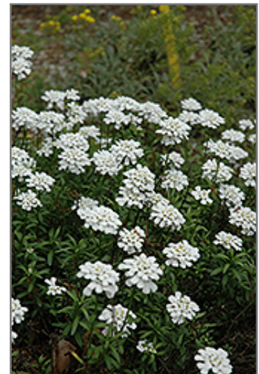
Purity Candytuft flowers

We are so proud of the nursery stock that we have carefully selected for superior quality and performance, WE GUARANTEE ALL TREES, SHRUBS, EVERGREENS FOR 2 YEARS, AND ROSES FOR 1 YEAR!