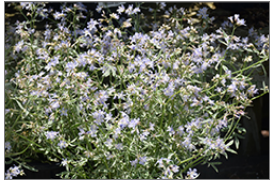
Touch Of Class Jacob's Ladder flowers

We are so proud of the nursery stock that we have carefully selected for superior quality and performance, WE GUARANTEE ALL TREES, SHRUBS, EVERGREENS FOR 2 YEARS, AND ROSES FOR 1 YEAR!