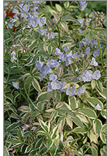
Touch Of Class Jacob's Ladder flowers

Touch Of Class Jacob's Ladder is an herbaceous perennial with tall flower stalks held atop a low mound of foliage. It brings an extremely fine and delicate texture to the garden composition and should be used to full effect.