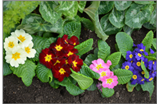
Primrose in bloom

Primrose is recommended for the following landscape applications;