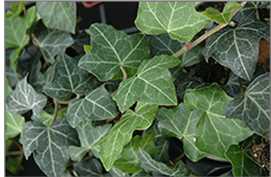
Baltic Ivy foliage

Baltic Ivy is recommended for the following landscape applications;