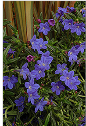
Grace Ward Lithodora in bloom

Grace Ward Lithodora is recommended for the following landscape applications;