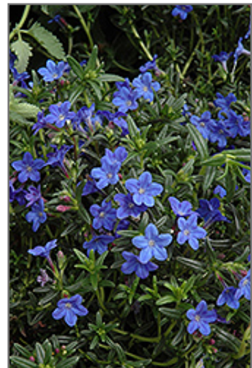
Grace Ward Lithodora flowers

We are so proud of the nursery stock that we have carefully selected for superior quality and performance, WE GUARANTEE ALL TREES, SHRUBS, EVERGREENS FOR 2 YEARS, AND ROSES FOR 1 YEAR!